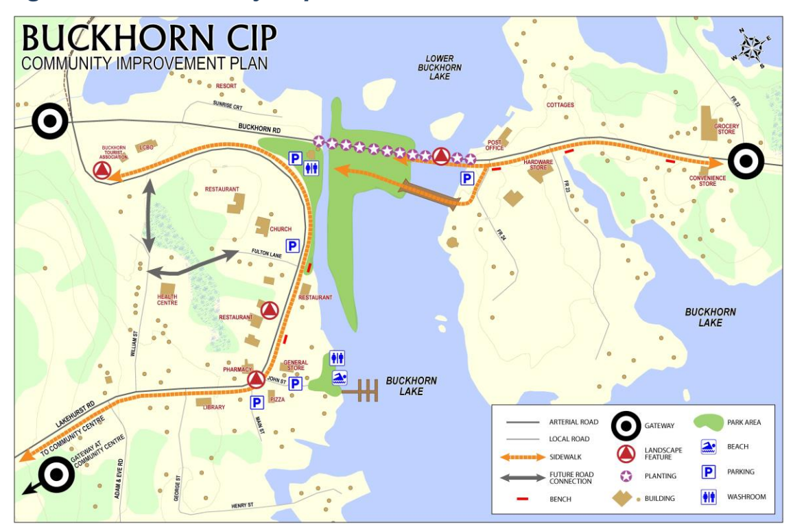
Figure 2: Community Improvements- Infrastructure

however, it needs to be repaired. Given an increasingly aging community, the walkway needs to be accessible for persons with disabilities and more utilizing assisted walking devices such as walkers or wheelchairs.