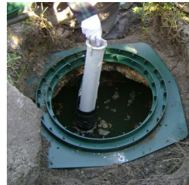
Homeowners can and should clean their effluent filters annually.