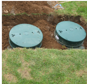
Tank risers ensure safety and accessibility for servicing.