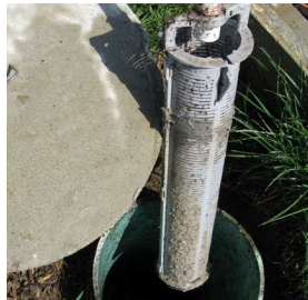
Clogged effluent filters can lead to sewage back ups.

Properly functioning onsite sewage systems can increase the value of your home, prevent costly repairs, help prevent raw effluent and excessive nutrients from leaching into our waterways, and help prevent contamination of aquifers - your source of drinking water!