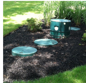
Landscaping so that the risers are easily accessible.